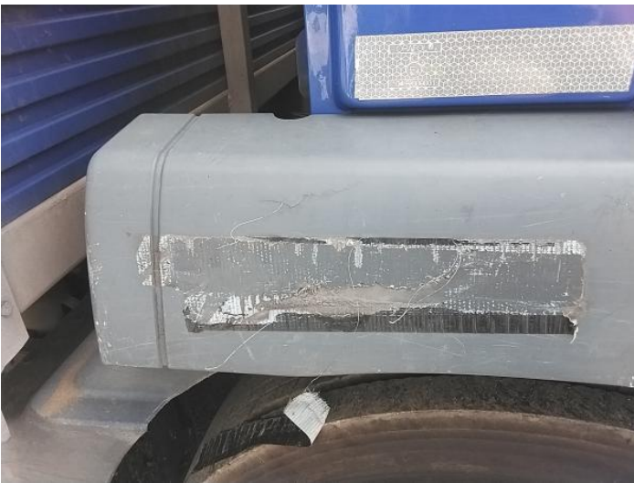
5: Qtr Panel Moulding os Broken Replace