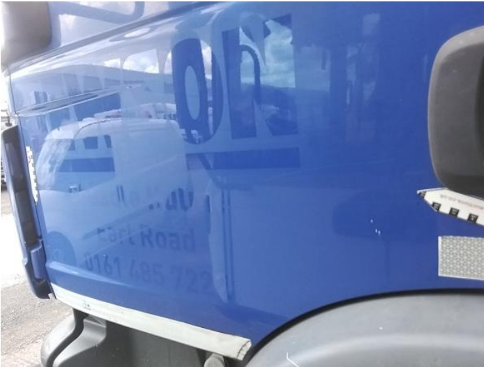
3: Door nsf Scratched Over 25mm Thru Paint