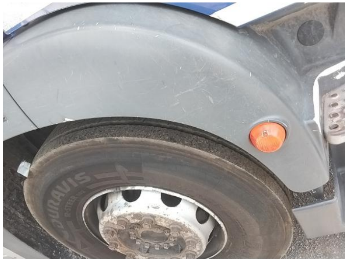
6: Wing osf Scratched Over 25mm Thru Paint