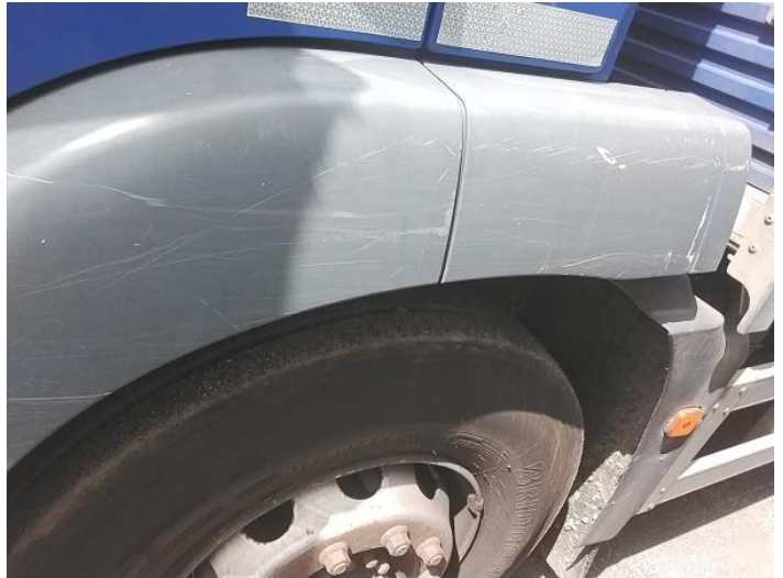
4: Wing nsf Scratched Over 25mm Thru Paint