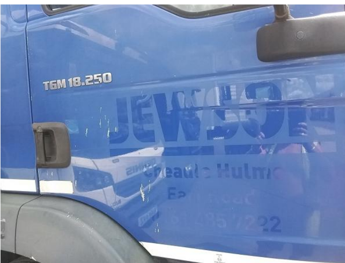
7: Door osf Scratched Over 25mm Thru Paint