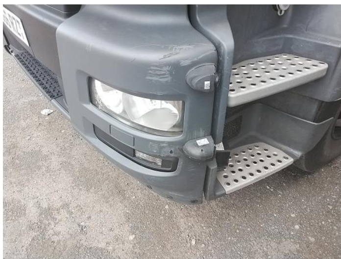
2: Bumper Front Moulding Scuffed (Unpainted) Over 100mm